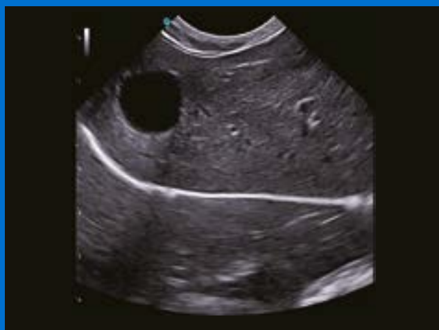
Canine Liver B Mode