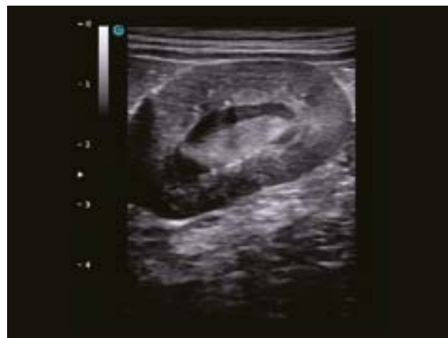
Canine Kidney, B Mode