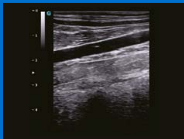
Canine Aorta, B Mode