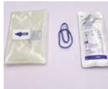
Sterile probe cover and gel