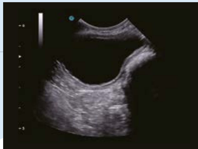
Canine Bladder, B Mode