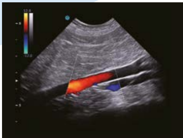
Canine Aorta, C Mode