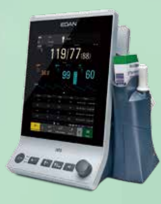
EDAN Quick TEMP